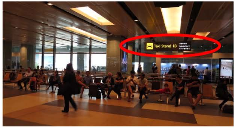
Opposite to the Bank Booth, you will find the Taxi Stand 1B. Ask the airport security /gatekeeper to help you locate a Normal Meter Taxi to the Roundtable Designated Hotel. Each taxi ride to the hotel costs around SGD 18-22.

Designated Hotel: Hotel Grand Pacific, Singaore Address: 101 Victoria Street, Singapore 188018